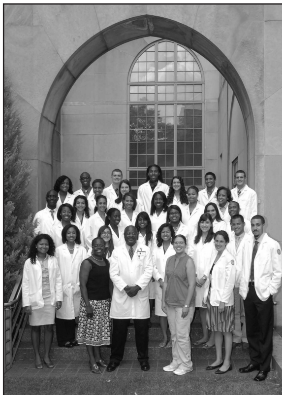
Travelers Summer Research Fellowship Fellowship Program-2011